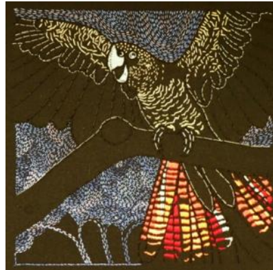
Black Cockatoo, October 30