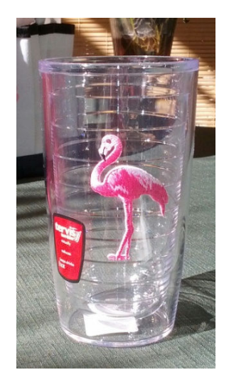
Tervis Tumbler, everyone's favorite in Florida. 12 oz. $10

Fold-up easel for your stitching directions with forty pages of storage space. When you are done just fold it up and off you go. You can even use it in the kitchen for following recipes. $15