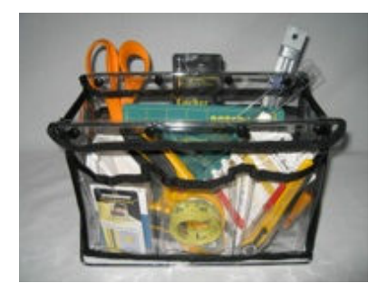
HANDY CADDY For all your stitching supplies $15 (white only)