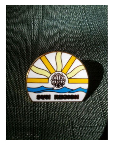
Sun Region Pin $5