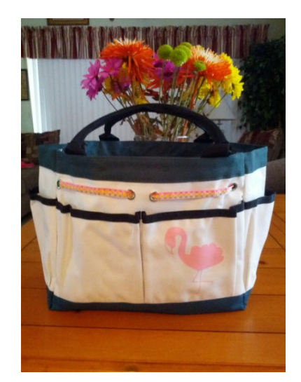
Tote bag with seven pockets, great project bag at a great price$. 12