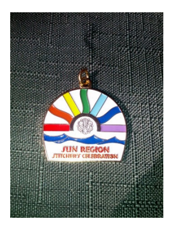
Celebration Charm $5