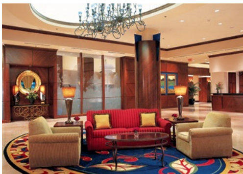
Lobby of the Orlando Marriott, Lake Mary,

For our first meeting of 2011 we shall be returning to Orlando Marriott Lake Mary (where we met in March of this year). The meeting will be held on Saturday, March 26 and Sunday, March 27, 2011. The address is 1501 International Parkway. The hotel is conveniently located off of I-4 at exit 101A. Our host chapter for this meeting is Sarasota.