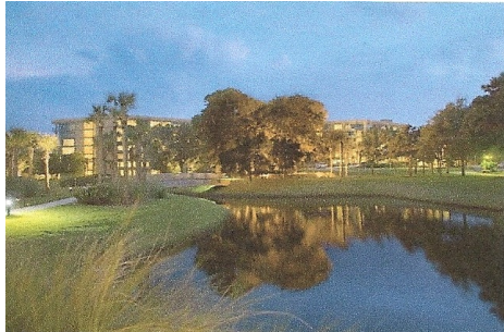
Sawgrass Marriott Golf Resort & Spa Ponte Veda Beach, FL

Our second Sun Region meeting of the year is at Sawgrass Marriott Golf Resort and Spa in Ponte Veda. This resort is just south of Jacksonville Beach off of Florida SRA1A. Amenities are room coffee, daily newspaper, 24 hour access to health club, Cabana Club Beach access and hotel transportation to Cabana Beach Club, Golf and Sawgrass Shopping Village. There is free self parking.