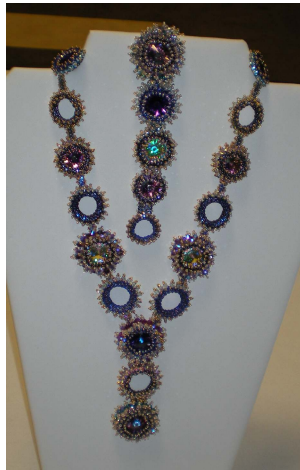
Glitz and Rivolis

Each year, your region directors join together to create a special and unique item to donate to the EGA seminar auction. This year we will donate a necklace, bracelet and earrings with the theme "Circle of Friends." Each RD will bead 2 circles and provide quotes and pictures about friendship to include in the accompanying booklet. Photos: We found a couple of hours after one of the meetings to enjoy each other's company and work on our project.